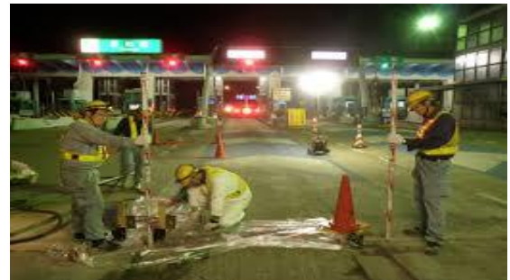
Repairing for tollgate of high way