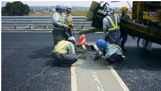
Repairing for expansion joint of Bridge

Emergency construction works as road, bridge, airport, railway, bridge, harbors.