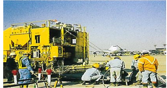
Repairing for apron of Airport